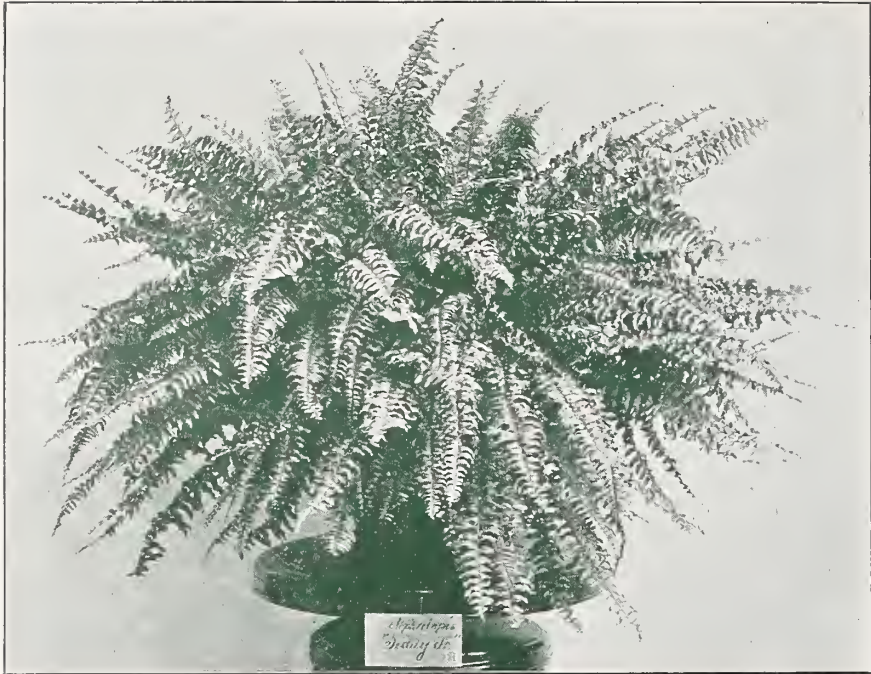
NEPHROLEPIS TEDDY, JR.